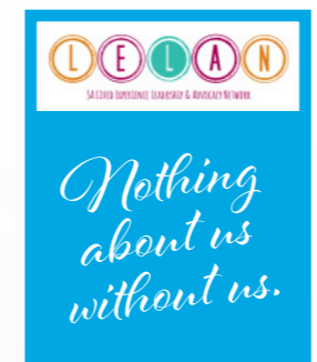
Strengthening and supporting lived-experience leadership