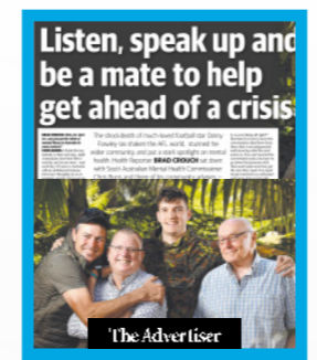
Improving Mental Health Literacy

PROJECTS COMPLETED OR UNDERWAY and more coming!